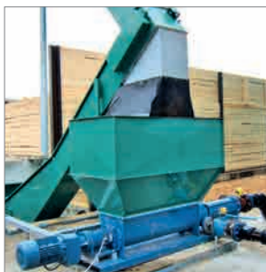
Feeding the pump via a transferring hopper

The task of pumps in biogas plants is to transport viscous substrates between the fermenters. Depending on the substrate to be pumped and the respective biogas plant, we are able to offer different pump types. Our experience enables us to develop practical solution concepts.