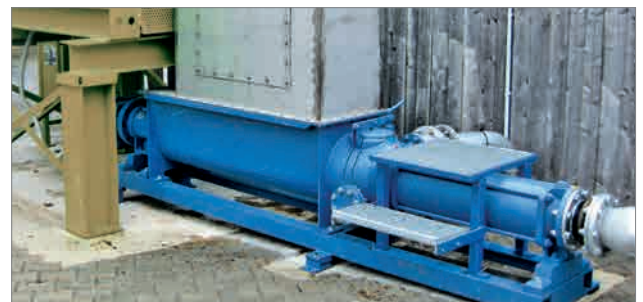
Introduction of solid substances after crushing