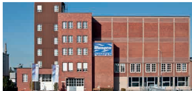
Headquarter building in Wangen, Germany

Our customers hold us in high esteem, motivating us to retain and improve on our company values every single day.