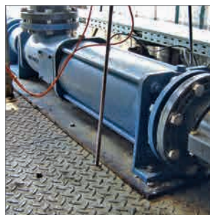
Pumping substrate between fermenters